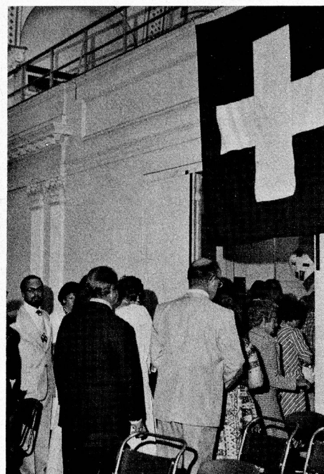
Some of the participants at the 1st August service entering the appropriately adorned Eglise Suisse.