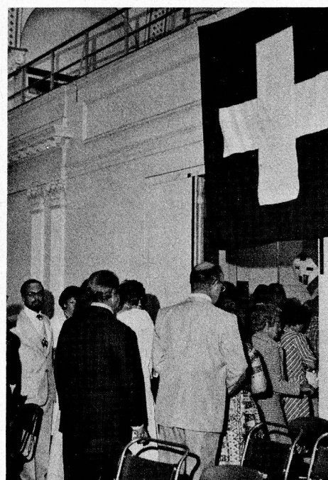
Some of the participants at the 1st August service entering the appropriately adorned Eglise Suisse.