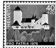
Murten / Morat