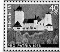
Murten / Morat