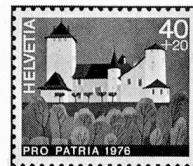
Murten / Morat