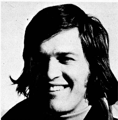
◀ Bernhard Russi, a well-deserved second place in downhill racing.