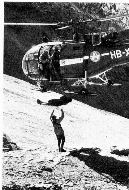
Life-saving in high mountains, loading aboard an Alouette III helicopter by means of a net.