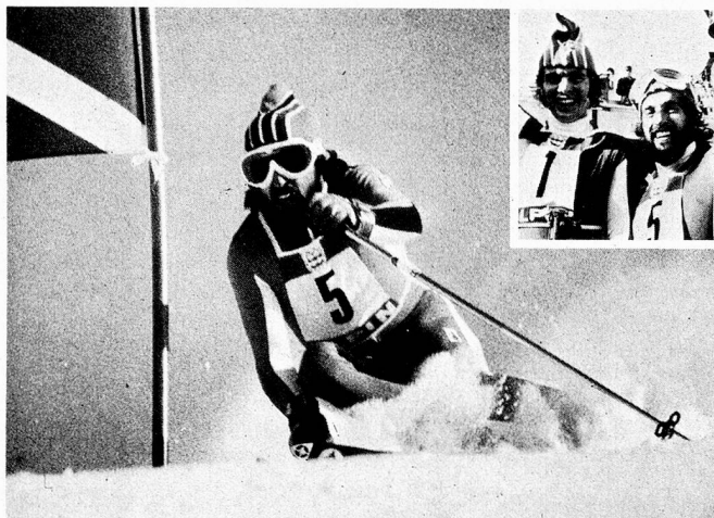
Extraordinary result in the giant slalom: Heini Hemmi and Ernst Good won the gold and silver medals.

Hemmi, winner of olympic medal, in action.