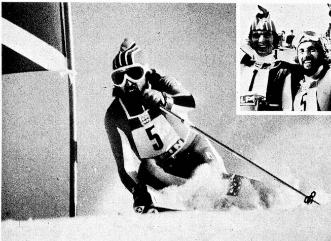
Extraordinary result in the giant slalom: Heini Hemmi and Ernst Good won the gold and silver medals. Hemmi, winner of olympic medal, in action.