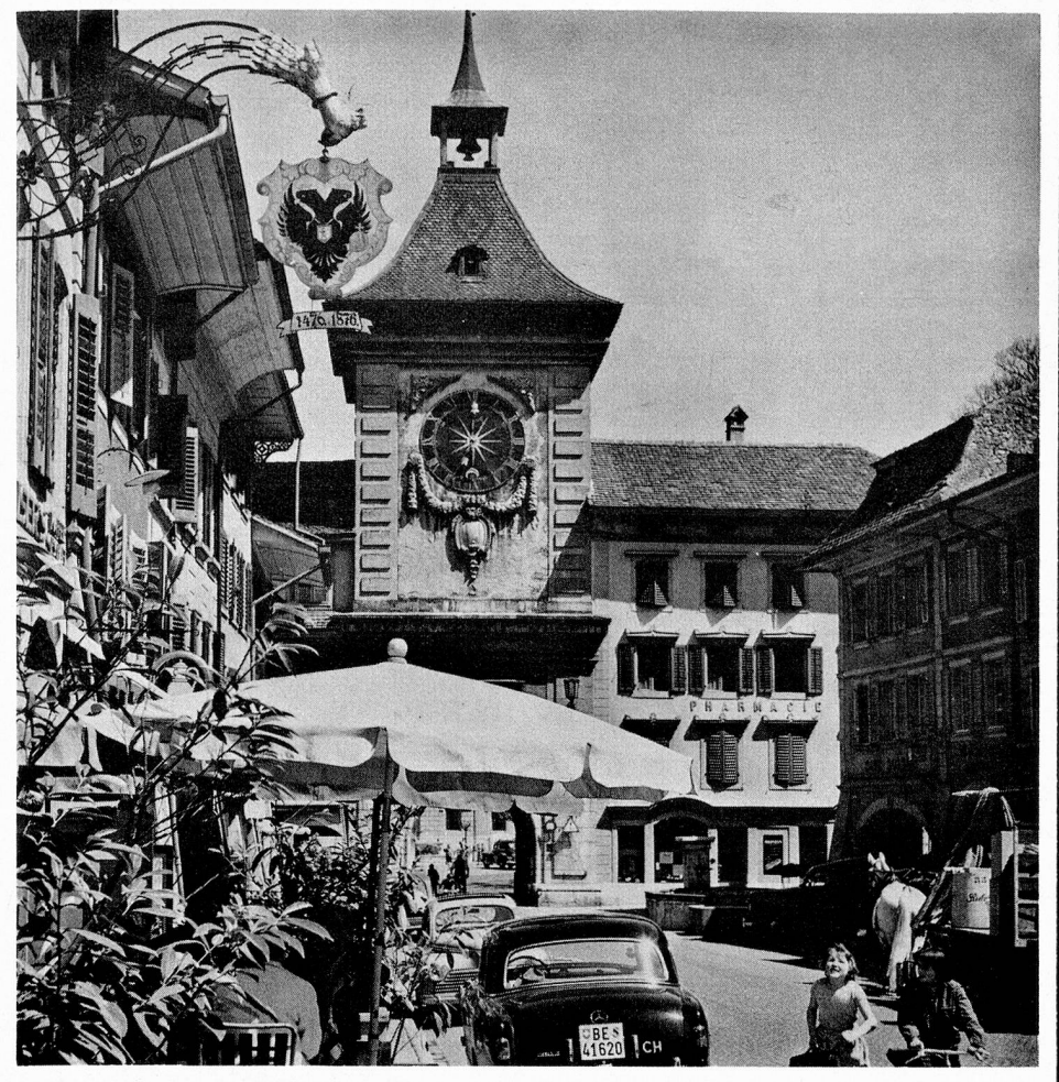
A view of the medieval town of Murten (canton Fribourg) outside whose walls the Confederates vanquished Charles the Bold of Burgundy in 1476.