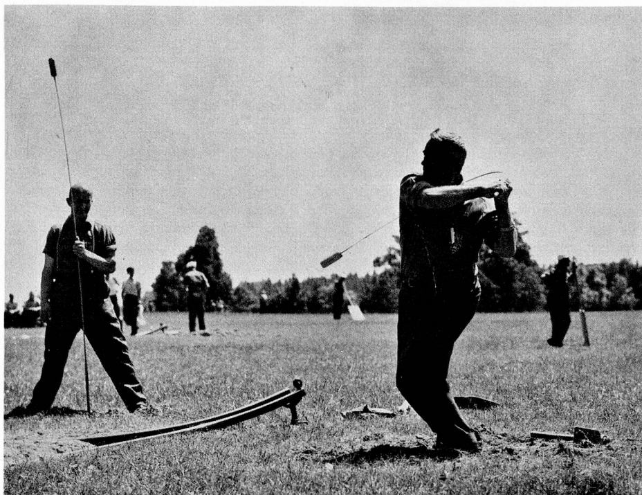
Hornussen is recognized in Switzerland as a national game. Here the Hornuss is sent down the field using a long willow-handled mallet.

Travellers from the Grimsel Pass to Meiringen (or vice-versa) should make a point of calling at the new rock crystal museum in the holiday village of Guttannen. There, crystal hunter and mountain guide Ernst Rufibach has put his fine collection, formed over 20 years, on view to the public. In the 38 glass cabinets can be seen rock crystals, smoky quartzes, pink fluorites and various other minerals.