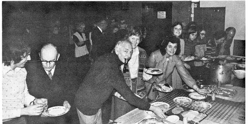
The happy smiles on these faces bear witness to the fact that the soirée familiale described left was a success!