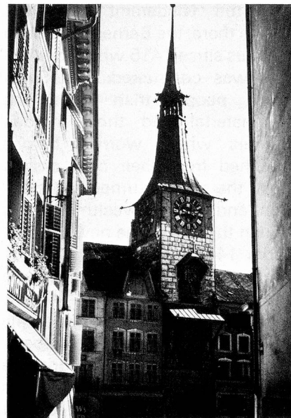
Clock-Tower in Solothurn