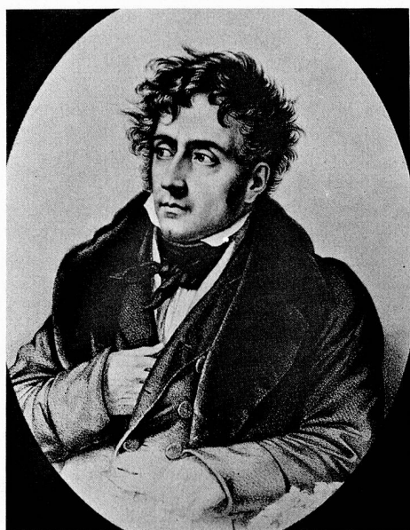
Françoise René, Vicomte de Chateaubriand, 1768-1848, French author and diplomat.

Chateaubriand was not only the most celebrated writer of the first half of the nineteenth century; he was also gifted with a political intelligence. Yet while his success as a literary Midas (who borrows from right and left and transforms all he touches into gold) came easily and remained with him all his life, his political career was confined to two years at the Ministry of Foreign Affairs. The reasons for this are complex, deriving partly from events and partly from his own character. He was a man of complete integrity. Thus, upon hearing of the execution of the Duc d'Enghien in 1804 he at once resigned as Minister to the Valais, to which he had just been appointed and so condemned himself to ten years of political exile. His ambition was enormous, yet he sacrificed it to a cause about which he himself soon lost all illusions. A legitimist by conviction, while at the same time a passionate advocate of constitutional monarchy and freedom of the press, he placed himself in an impossible situation; by his liberalism he incurred the dislike and mistrust of the Kings whose cause he faithfully supported.