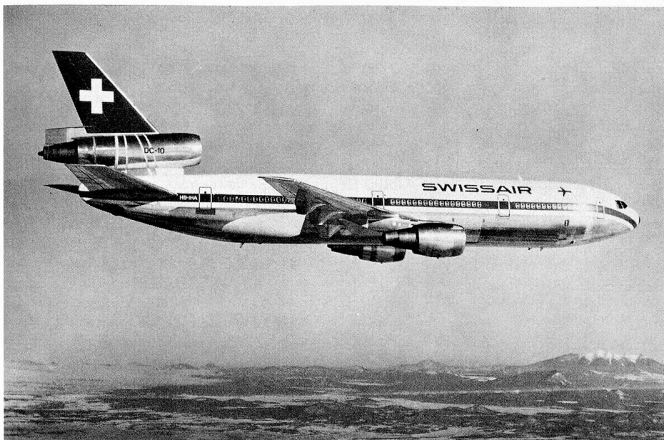
This DC10-30 wide-bodied jet is one of the latest additions to Swissair's fleet. With the advent of these giants of the air Swissair has sold two of its DC8s — see story right.