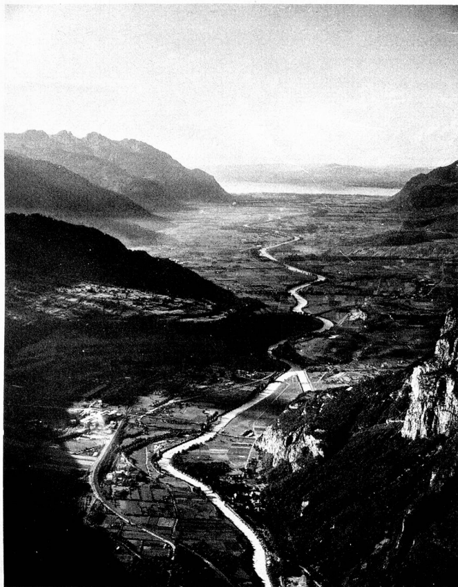
The lower Rhone Valley and the region where the river flows into the lake of Geneva.