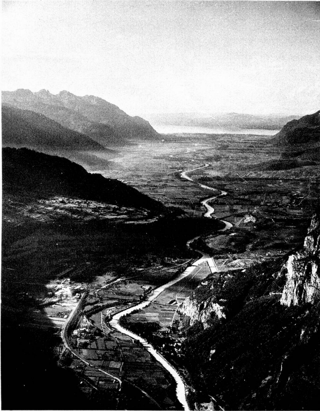
The lower Rhone Valley and the region where the river flows into the lake of Geneva.