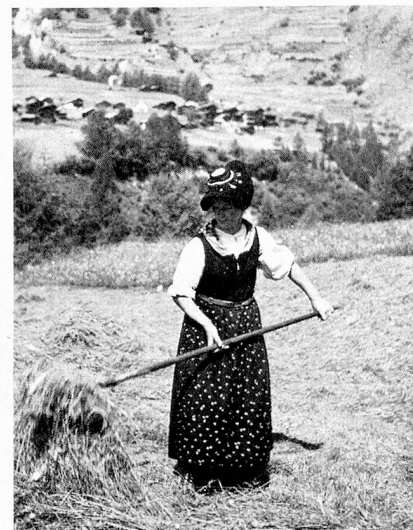
Farm wife in the Hérens Valley.

On the one hand the verdict is justified that the Valais has been gripped unhampered by touristic and industrial interests. On the other, I am anxious to stress a number of tremendous efforts and the significance of certain undertakings which turned out as if it had meant to create new