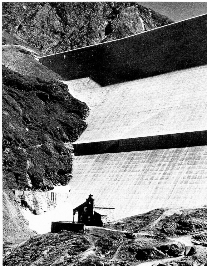
The imposing 281 m high dam «Grande Dixence» in the Val des Dix.