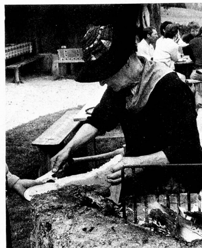
Raclette, a cheese-speciality of the Valais region.