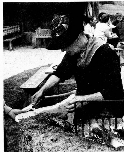
Raclette, a cheese-speciality of the Valais region.