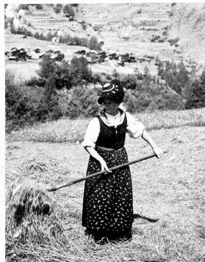
Farm wife in the Hérens Valley.

On the one hand the verdict is justified that the Valais has been gripped unhampered by touristic and industrial interests. On the other, I am anxious to stress a number of tremendous efforts and the significance of certain undertakings which turned out as if it had meant to create new