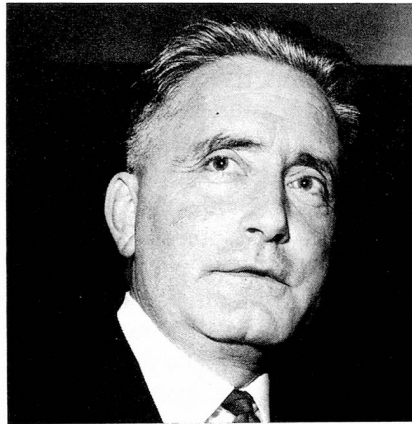
Mr G.-A. Chevallaz, Federal Councillor.

Voting participation in this matter was 39,7 percent. The draft proposal to improve federal finances was rejected by 623 548 yes to