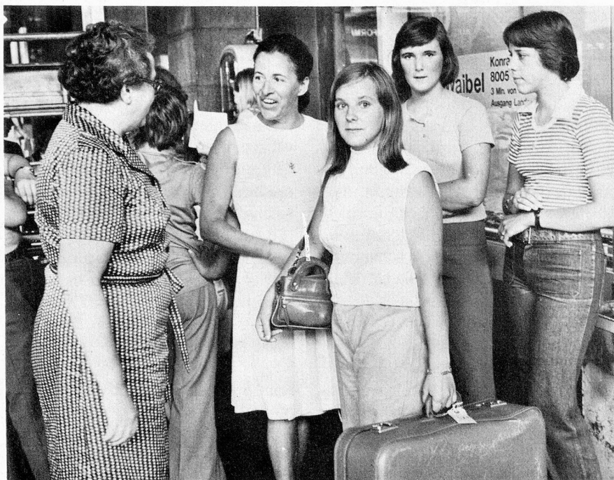
The meeting