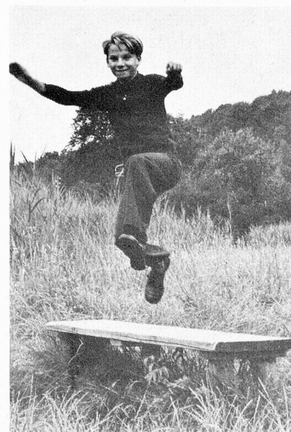
I don't see any obstacles