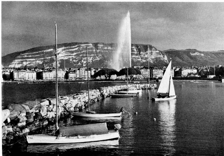
Geneva waterspout and the Salève hill in the background.

Since then, the Commune, relying on this charter, has consolidated and expanded all the time and that