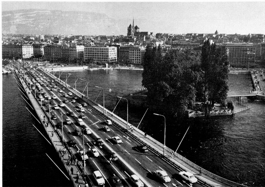
The Mont-Blanc bridge and the isle of Jean-Jacques Rousseau (ONST)

inspite of a row of permanent and temporary opponents: the Counts and later Dukes of Savoy as well as some of their faithful bishops. It did not take long before the Commune administered its property independently, had its own jurisdiction and concluded agreements with the towns of the Confederation. In the course of the troubled and martial times of the Reformation (1535/36), Geneva acquired its full independence and became a republic.