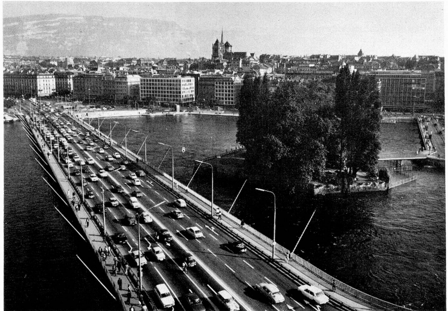
The Mont-Blanc bridge and the isle of Jean-Jacques Rousseau (ONST)

inspite of a row of permanent and temporary opponents: the Counts and later Dukes of Savoy as well as some of their faithful bishops. It did not take long before the Commune administered its property independently, had its own jurisdiction and concluded agreements with the towns of the Confederation. In the course of the troubled and martial times of the Reformation (1535/36), Geneva acquired its full independence and became a republic.