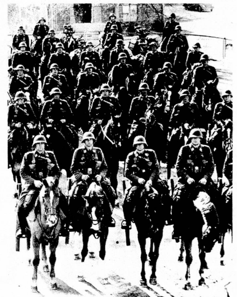
Swiss cavalry: already an image of the past.

The Federal Council decided to increase the old and new pensions under