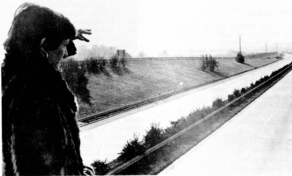
Deserted motorway during one of three traffic-ban Sundays last December.

The Federal Council announced that oil supplies were satisfactory, and that no further measures to save fuel would be ordered for the time being.