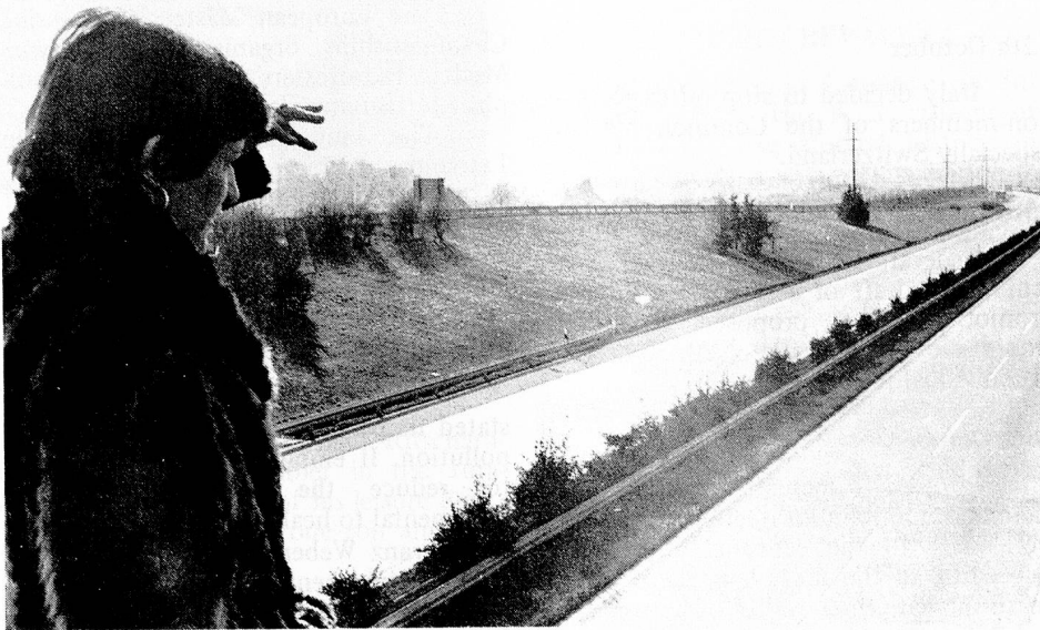
Deserted motorway during one of three traffic-ban Sundays last December.

The Federal Council announced that oil supplies were satisfactory, and that no further measures to save fuel would be ordered for the time being.