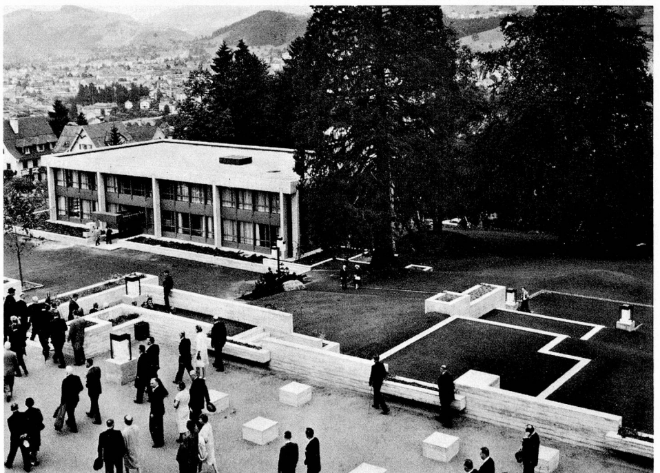
Inside the premises of the new economics and commerce school of St. Gall.