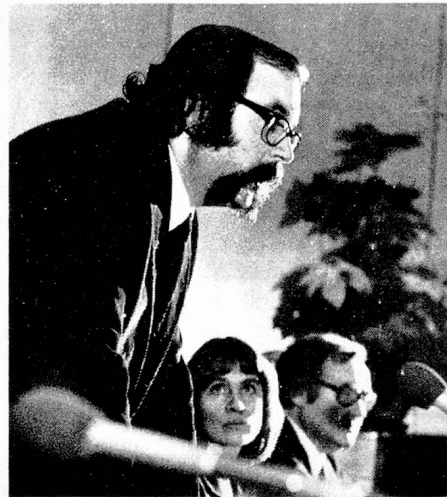
Jacques Chessex, the first Swiss to receive the Goncourt Award, thanks writers Pierre Sabatier and Francoise Mallet-Joris, of the Goncourt Academy, at prize giving ceremony in Lausanne.