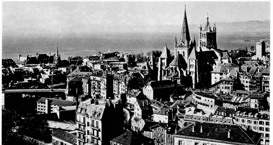
Lausanne, scene of Chessex's novel "l'Ogre".