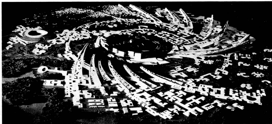
Model of Auroville