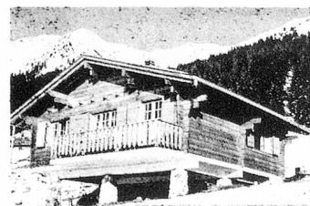
above: chalet at "Les Esserts" in Verbier.

one room with two normal beds and a set of two bunk-beds; a kitchen with all appliances including toaster; a bathroom with WC, separate WC and balcony, cost £59 a week in November-December, £109 a week at Christmas, £79 a week in January, £83 a week in February, the same in March, £89 at Easter and £79 in April. To this must be added 85 francs for final cleaning and 3 francs a day for Local Tax and electricity. A three-roomed apartment of the first floor of the new apartment house "Pirata" in Zermatt offers the following facilities: a well-furnished living-room with rustic dining corner, 2 divans, a balcony with view of the Matterhorn, one twin-bedded room, one bedroom with 2 x 2 bunks, modern kitchen with electric cooker, oven, fridge, bathroom with WC, separate WC, fitted carpets, vacuum cleaner, iron, deck-chairs, use of washing machine. Rents per week are the following: November-December £50, Christmas £124, January £83, February £124, March £124, Easter £124, April £83. 80 francs are charged for final cleaning and other charges amount to 1.50 francs a day. Both the above premises are let for six persons. This means that costs vary from £8 a week per person to £20 a week, which appears an interesting proposition.