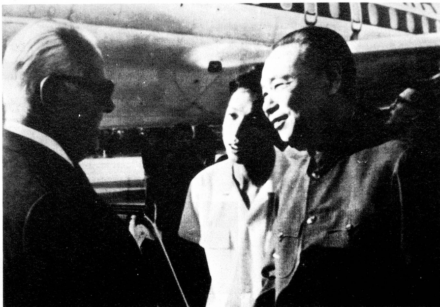
Federal Councillor Pierre Graber is received in Peking by his colleague Tschü Peng Fei

schoolboy enabled archeologists to establish that 400 000 years ago, prehistoric beings lived in Switzerland.