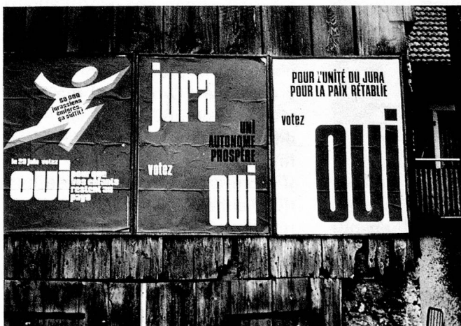
Posters galore ...