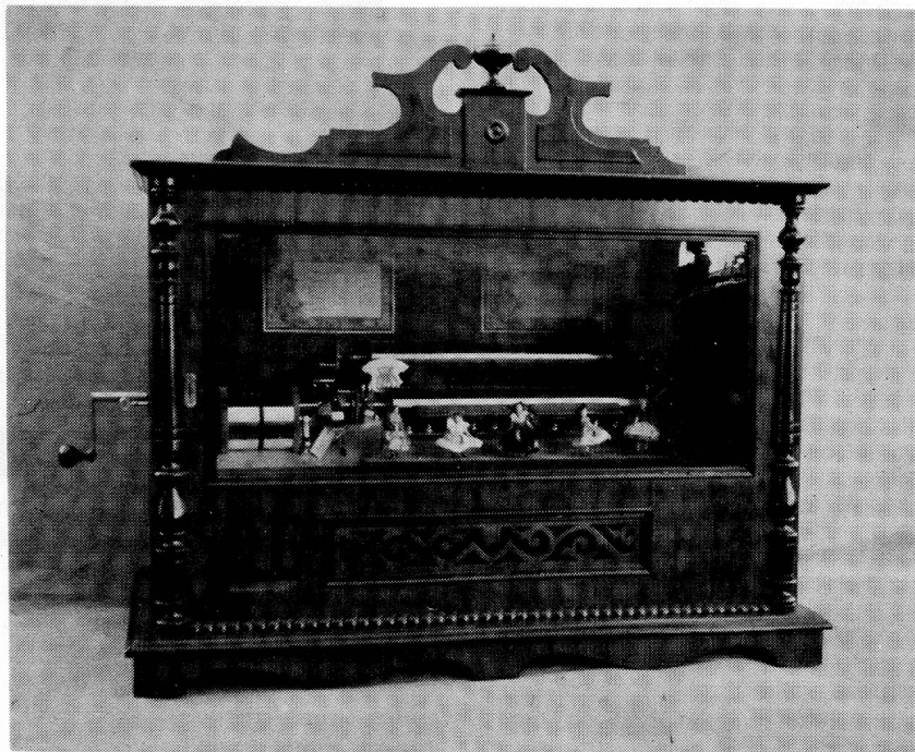
Luxury musical box manufactured in St. Croix in 1900.