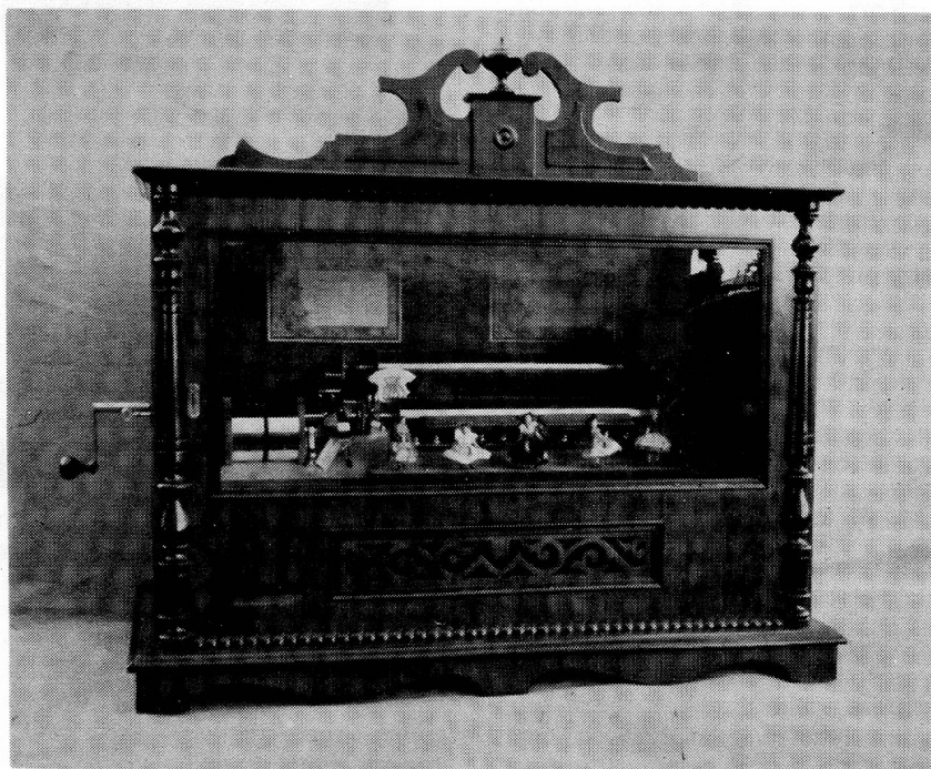
Luxury musical box manufactured in St. Croix in 1900.