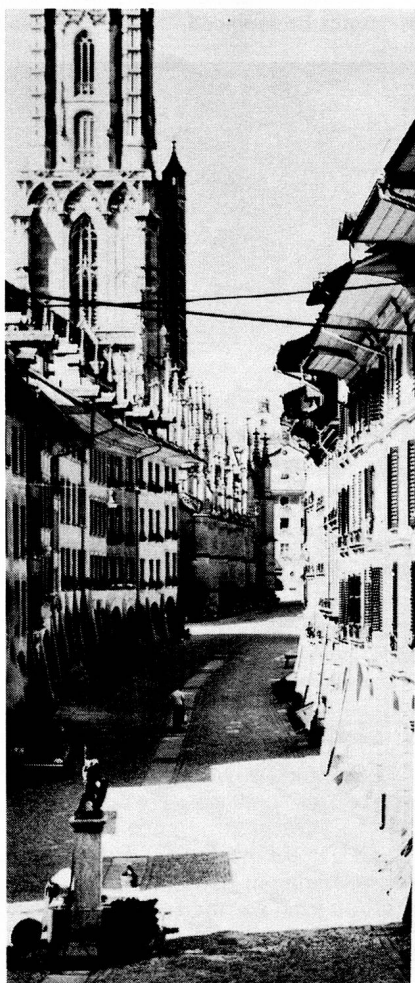
The Junkerngasse, one of Berne's old streets