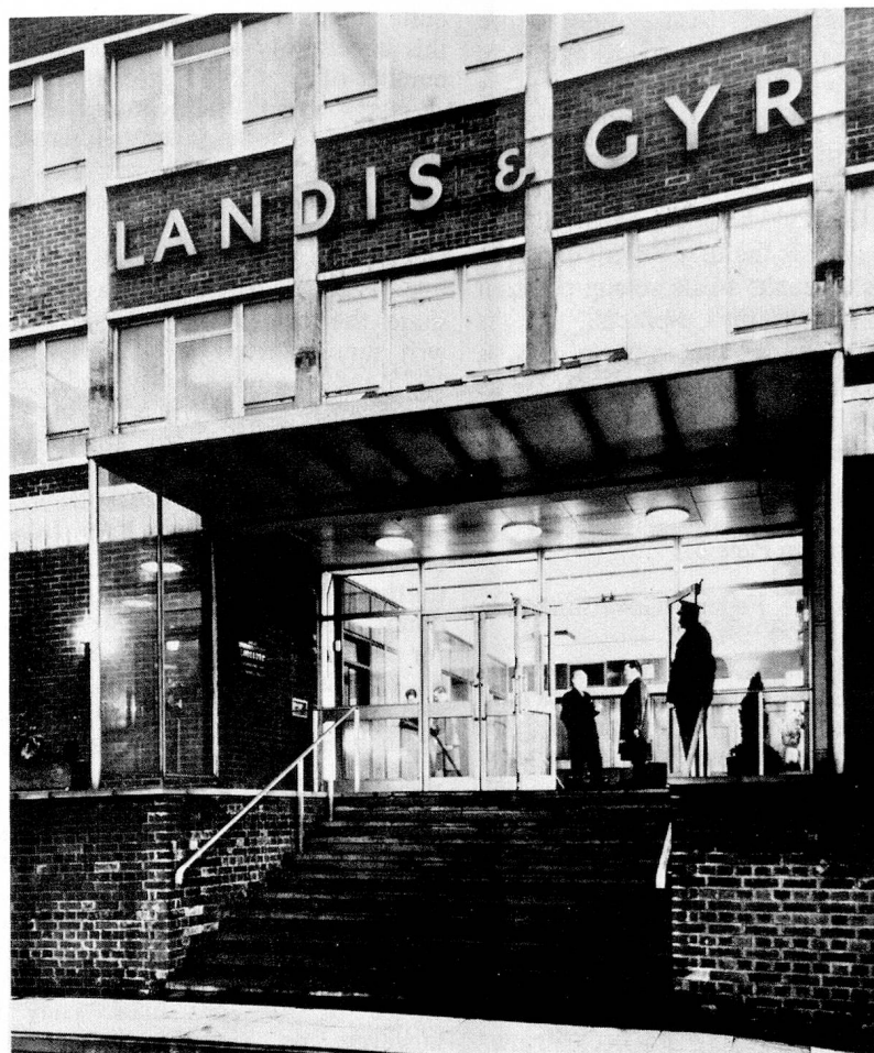
Entrance to Landis & Gyr Administrative Block

during its last financial year because of the falling value of the pound, which has increased the cost of imports and the