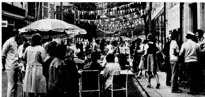
Swiss Week Festivities (Halifax Courier).