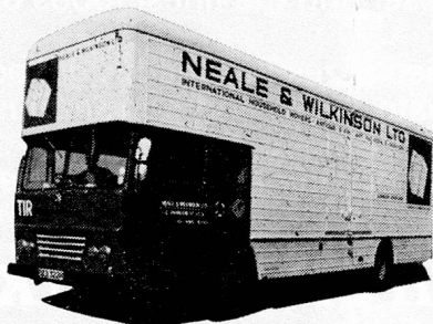
MEMBERS OF EUROVAN