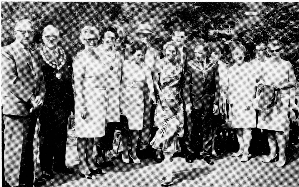
A family reunion of Yorkshire Swiss and Hebden Bridge dignitaries

At half past ten the assembly was complete and we walked to the Civic Hall, a stone's throw away, and began our day together with a cup of coffee. Having admired the artistic achieve-