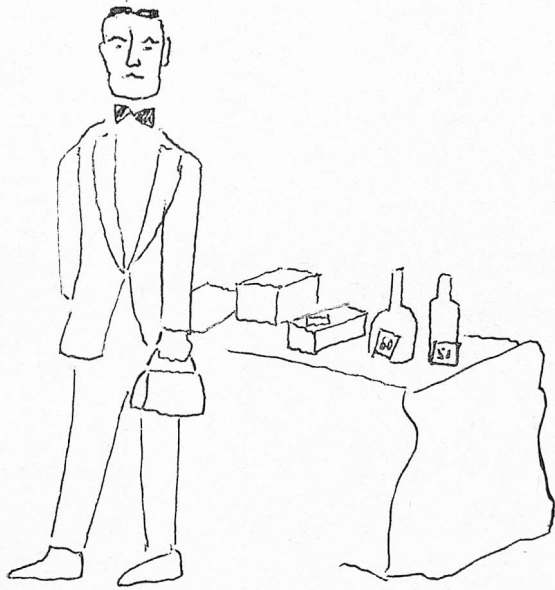
City Swiss Club Ball