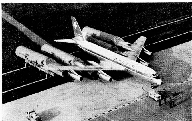
Swissair's new detuner installation is seen here connected to the engines of Coronado HB-ICH operated by Balair.

Swissair's Metropolitans were progressively replaced from October 1966 onwards by Caravelles and DC-9s.