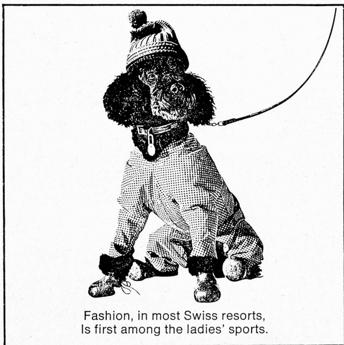
Fashion, in most Swiss resorts, Is first among the ladies' sports.