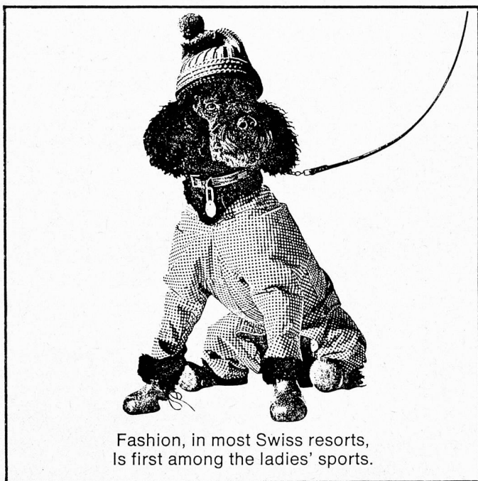
Fashion, in most Swiss resorts, Is first among the ladies' sports.