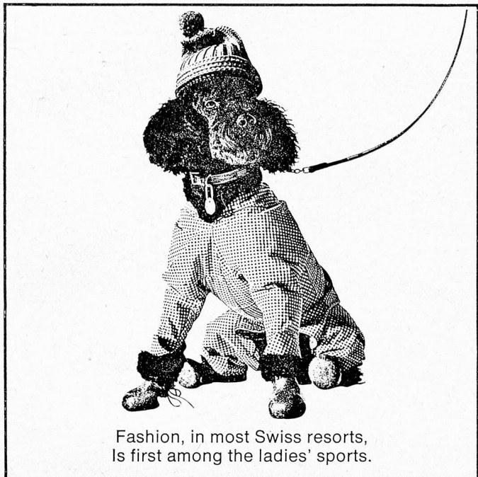
Fashion, in most Swiss resorts, Is first among the ladies' sports.