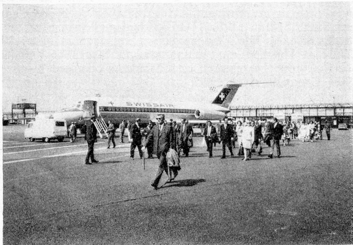
The new aircraft after arrival at Gatwick Airport

This will mean that travelling time to Basle will be cut by twenty minutes from the two hours and twenty minutes taken by the propeller-driven Metropolitans which the DC-9 replace. All Swissair services between the U.K. and Switzerland will now be by jet.