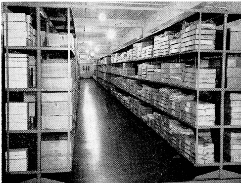
The illustration shows Acrow Cantilever Shelving installed in the Guildford branch stockroom of Marks & Spencer Ltd.

M·A·T TRANSPORT A.G., Sihlfeldstrasse 88. 8036 Zurich PHONE : 258992/95 TELEX : ZURICH 52458 - MATTRANS