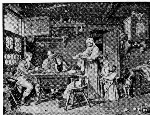
Sigmund Freudenberg, Bern, 1745–1801 Hospitality Coloured Engraving, Museum of Arts in Basle