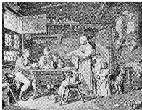
Sigmund Freudenberger, Bern, 1745 — 1801 Hospitality