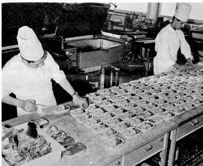
Preparation of main course dishes.

missing. Great efficiency and cleanliness and a very happy working atmosphere struck me everywhere.