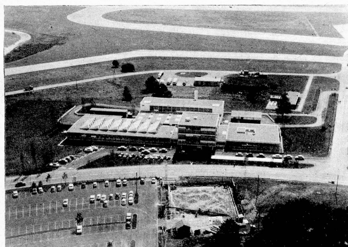
Aerial view of Swissair's Passenger Flight Service building at Zurich Airport. It clearly shows the one-way road leading through the centre of the building under a covered drive-way.

One of the buildings Swissair had erected at their own expense, is the "Borddienstgebäude", the large building where everything concerning the comfort of the passengers is taken care of.