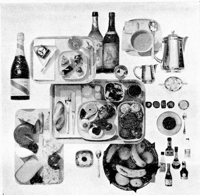
Swissair first class meal, showing the special crockery and cutlery designed for the jet age.

That brought my visit to an end, and I left with my curiosity satisfied but my imagination fired, and I could hardly wait for my next meal in the air.