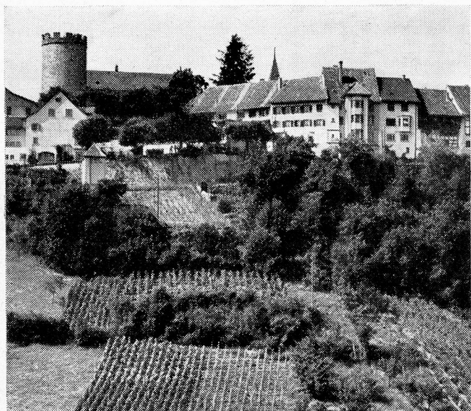
Swiss National Tourist Office 458 Strand, London W.C. 2