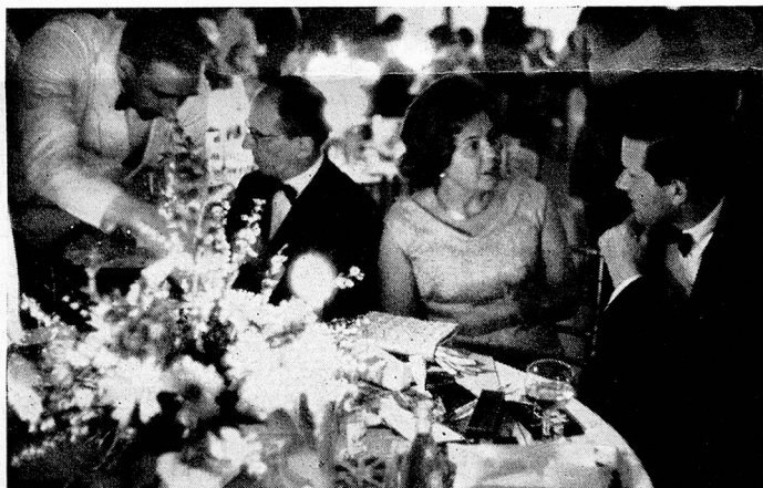
The Swiss Ambassador, Lady Wakefield and Lord Balniel at supper.