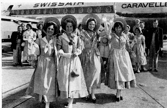
Genève Chante leaving Geneva by Swissair