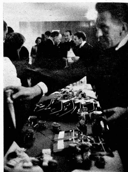
Prizes with table numbers on display

And so it came about that we journeyed to the Carlton Tower Hotel in London's fashionable Knightsbridge district on a beautiful, warm May evening of a kind only to be enjoyed in the British Metropolis. That it happened to be the thirteenth can't have deterred many superstitious invitees, for as many as 350 guests assembled in the attractively appointed ball room with its gaily decorated tables and subdued lighting.