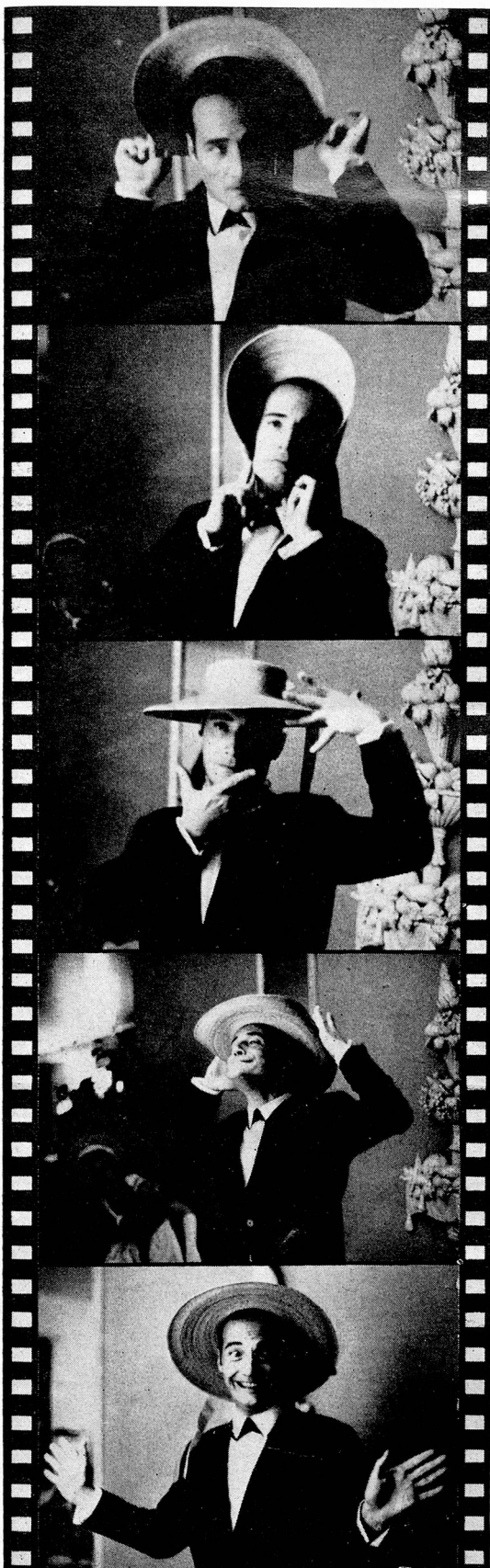
. . . without words