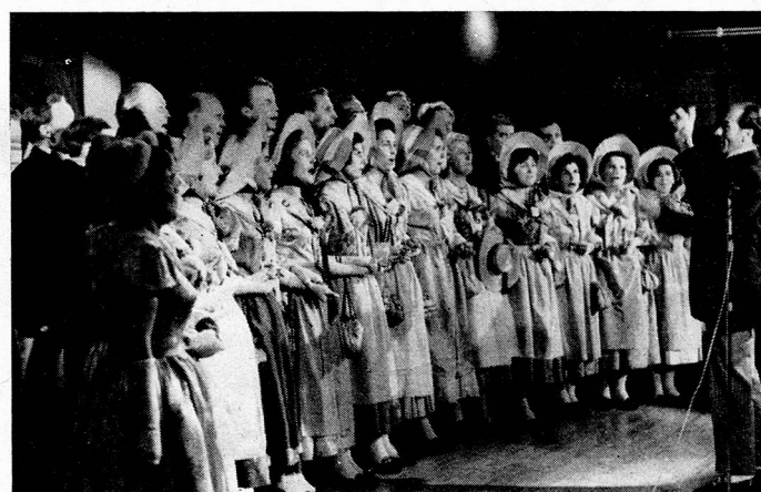
Geneva sings — delightfully.