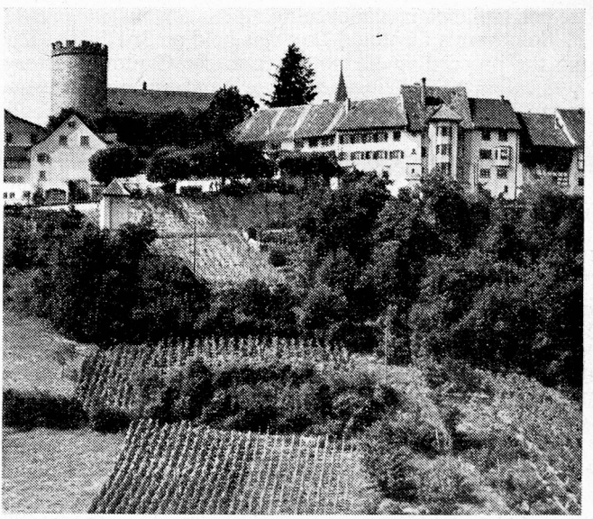
Swiss National Tourist Office 458 Strand, London W.C. 2