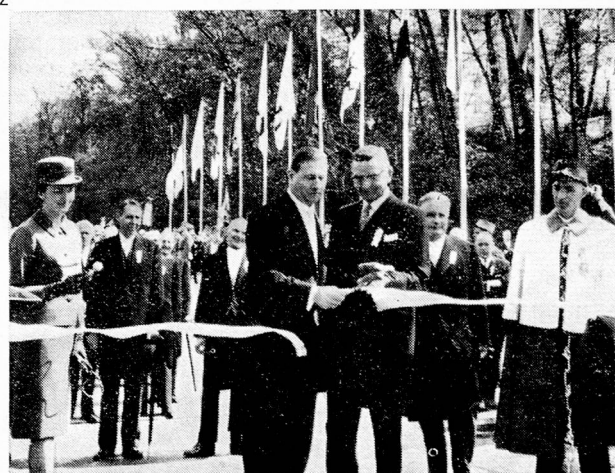
The president of the Swiss Confederation, Mr. Ludwig von Moos, is opening officially the EXPO 1964 in Lausanne Eröffnung der EXPO 1964 in Lausanne