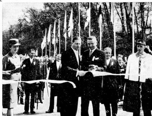
The president of the Swiss Confederation, Mr. Ludwig von Moos, is opening officially the EXPO 1964 in Lausanne Eröffnung der EXPO 1964 in Lausanne