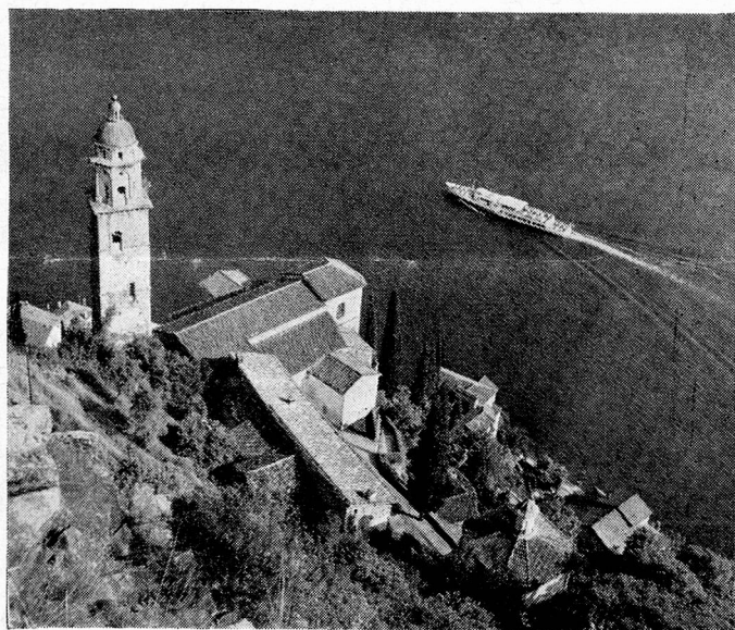
CORALE UNIONE TICINESE

In the true tradition of the Fête Suisse, local talent is included. Who better than the CORALE OF THE UNIONE TICINESE would qualify? For a good number of years this group of singers has entertained the Colony on many occasions. The CORALE, too, has gone through a crisis, but just recently its numbers have been increased considerably and the choir in its picturesque costumes will appear in new strength at the Fête Suisse. I understand its repertoire has been added to by some more attractive tunes from the Ticino and we can be sure of spending a happy twenty minutes listening to songs reminding us of the beauties of Southern Switzerland like this picture showing the Lake of Lugano with the famous church of Morcote.