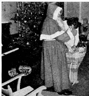
Father Christmas visiting our «Home»-family