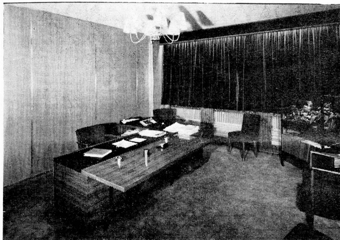
The Managing Director's Office.