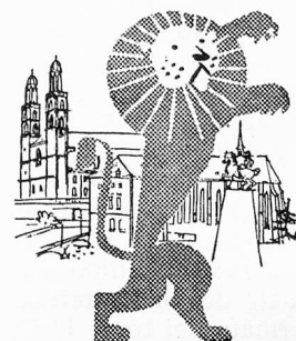
UK — Switzerland flights in association with BEA

For a full appreciation of the finer, more delectable points of European air travel, you must fly Caravelle 'Super Swiss'! For by weather-radar equipped Rolls-Royce powered Caravelle jetliners — cutting flying time to 90 minutes! — Swissair have set to wings a service between London and Zurich that is second to none. Elegant cabin interior, superb comfort and genuine hospitality make the 'Super Swiss' a supreme example of luxury in flight.