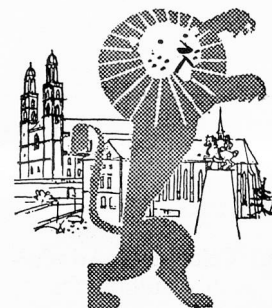
UK — Switzerland flights in association with BEA

For a full appreciation of the finer, more delectable points of European air travel, you must fly Caravelle 'Super Swiss'! For by weather-radar equipped Rolls-Royce powered Caravelle jetliners — cutting flying time to 90 minutes! — Swissair have set to wings a service between London and Zurich that is second to none. Elegant cabin interior, superb comfort and genuine hospitality make the 'Super Swiss' a supreme example of luxury in flight.