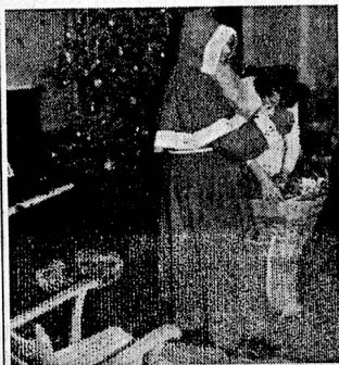
Father Christmas visiting our «Home»-family