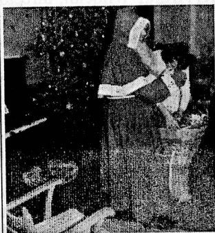
Father Christmas visiting our «Home»-family