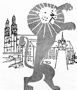
UK — Switzerland flights in association with BEA

For a full appreciation of the finer, more delectable points of European air travel, you must fly Caravelle 'Super Swiss'! For by weather-radar equipped Rolls-Royce powered Caravelle jetliners — cutting flying time to 90 minutes! — Swissair have set to wings a service between London and Zurich that is second to none. Elegant cabin interior — superb comfort — genuine hospitality — and the most impeccable cuisine make the 'Super Swiss' a supreme example of luxury in flight.