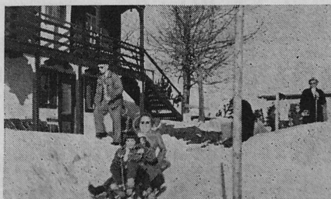
Our traditional excursion to the Rigi-Kaltbad in the New Year of 1960 towards the beautiful winter sun was an unforgettable experience to the guests of our "Home"—Ein unvergessliches Heimat-Erlebnis für unsere "Home"—Gäste war der Neujahrsausflug 1960 an die herrliche Wintersonne auf Rigi-Kaltbad.

«Home» for Swiss Nationals Living Abroad — a «pied-à-terre» in the homeland