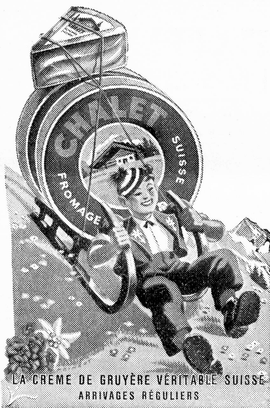
Swiss Chalet Cheese is a real treat for Cheese lovers