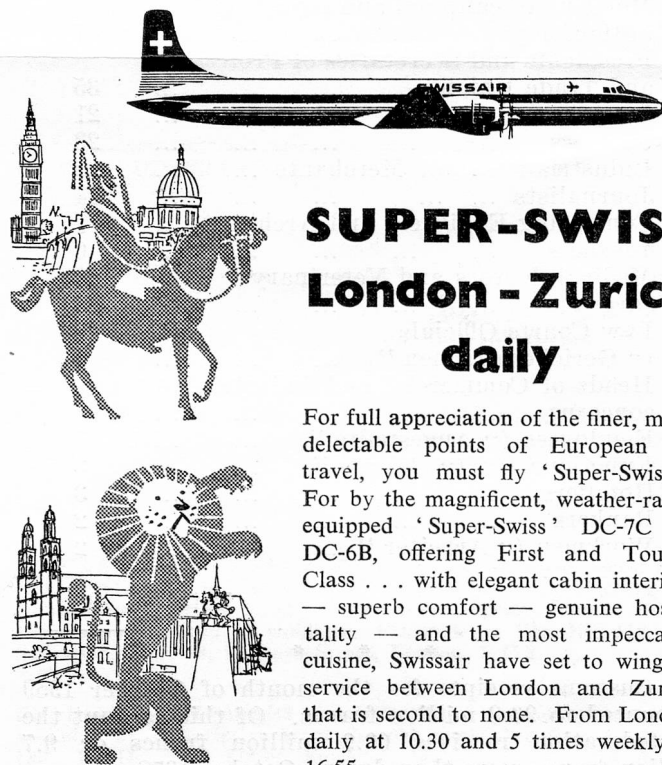
All UK-Switzerland flights are operated in association with BEA