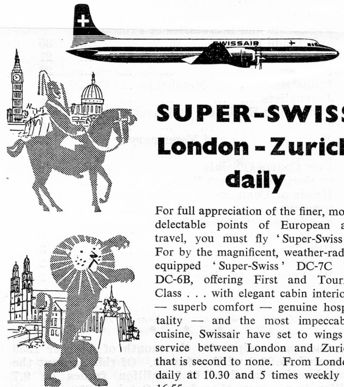
All UK-Switzerland flights are operated in association with BEA